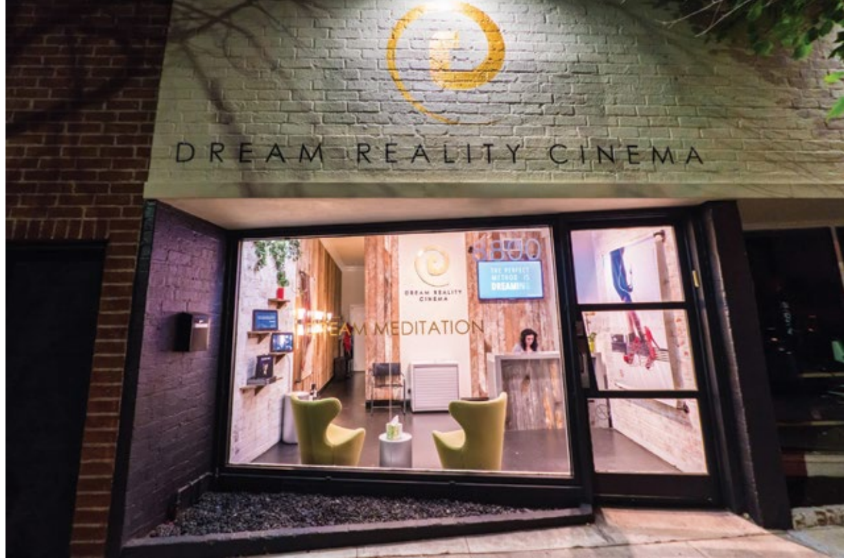
Dream meditation is rising, to clean out the subconscious and tackle everything from traumatic stress to sleep disorders - like at Dream Reality Cinema (Beverly Hills).