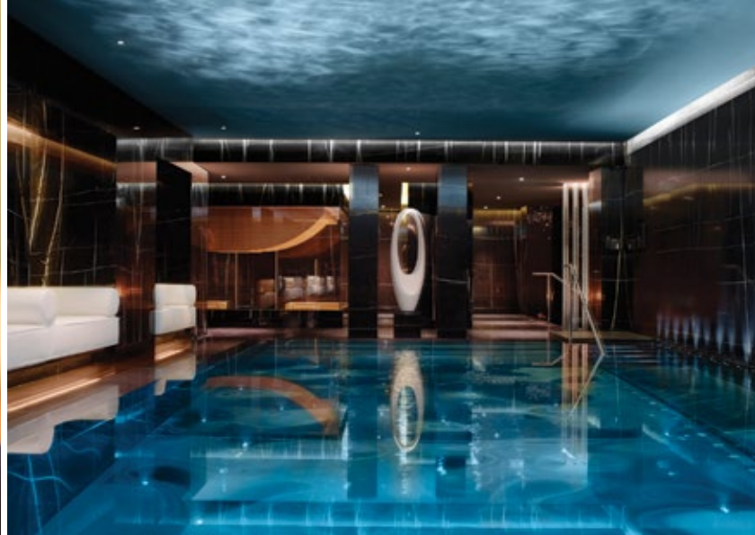
ESPA Life at Corinthia Hotel London has just brought in a “Neuroscientist in Residence” - Dr. Tara Swart from MIT - for an “integrative” approach to mental wellness.

was more effective at reducing depression relapses than antidepressant medication. A 2015 meta-review found that yoga improved symptom scores for anxiety and depression by about 40%. And a large, new Ghent University meta-review showed that happiness isn't just some “feeling”, it improves focus, imagination and complex issues of mental flexibility - i.e., the very way your brain processes external and internal information.