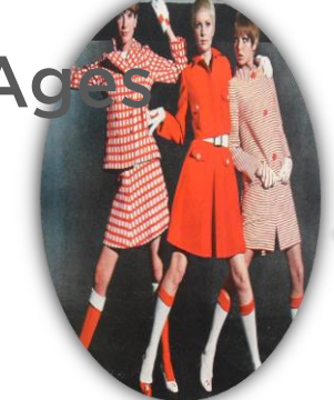
SWINGING SIXTIES c. 1960s